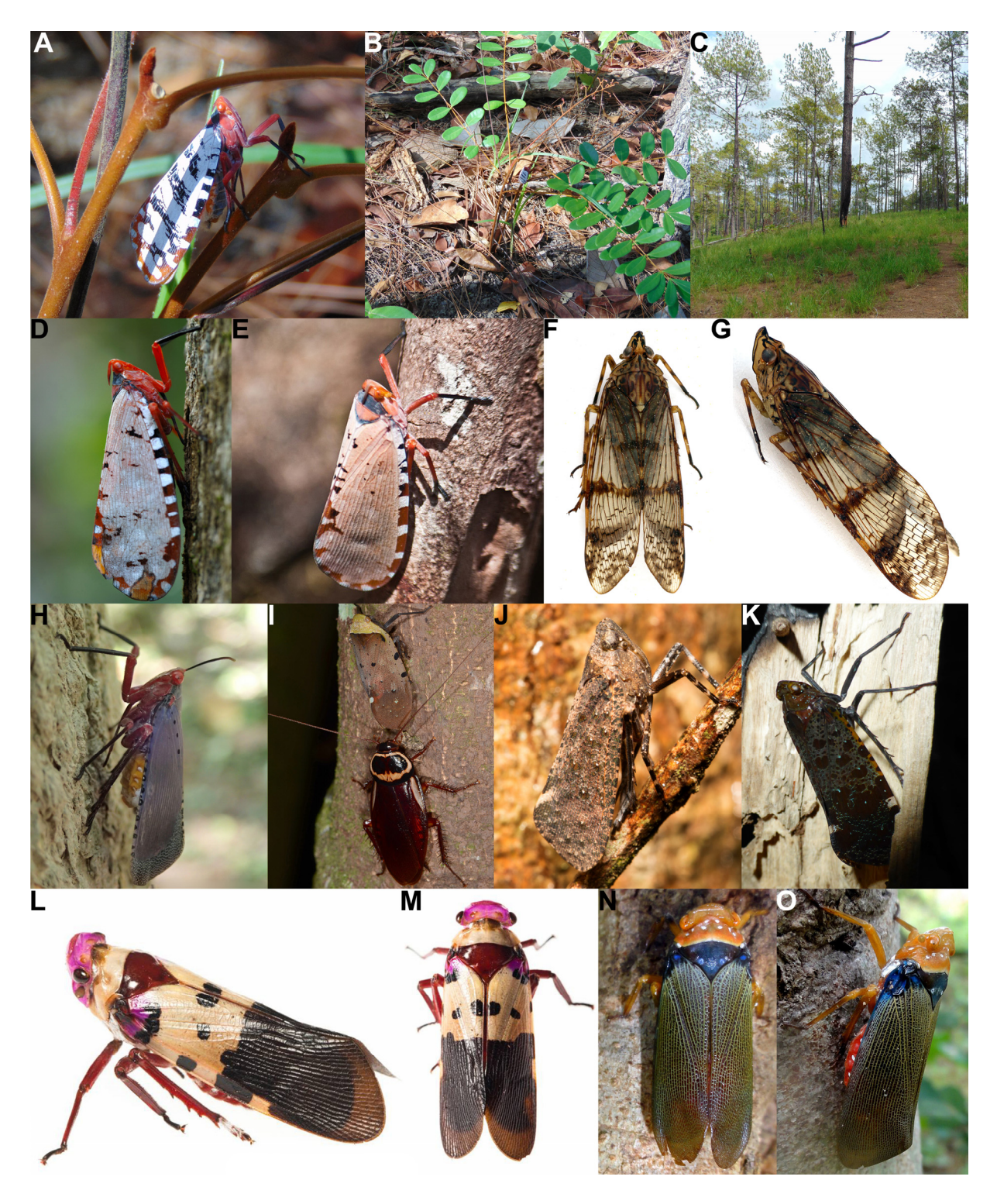
Fig. 2. A–G, Aphaena discolor. A–B, specimen on his host-tree, Kirirom, 9.V.2015. C, habitat in Kirirom, 9.V.2015. D, Pursat, Cardamom, 2.I.2009. E, Koh Kong, Tatai, 5.III.2012. F–G, Dichoptera sp. Chambok, 5.V.2015. H, Kalidasa nigromaculata, Siem Reap, Angkor, 10.VIII.2014. I, Penthicodes atomaria tended by a cockroach, Cardamom Mts, 4.VIII.2013. J, P. pulchella, Siem Reap, 18.IX.2013. K, P. variegata, Mondulkiri, O Reang District, 19.V.2015. L–M, Polydictya tricolor, Siem Reap, Angkor, 1.VIII.2013. N–O, Polydictya sp., 8 km NNW Angkor, 6.XI.2013.