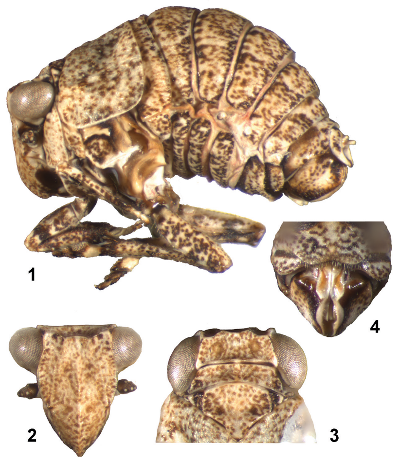
Figs 1–4. Campures pallens gen. et sp. n., holotype: (1) lateral view; (2) frontal view; (3) head and pro- and mesonotum, dorsal view; (4) ovipositor and VII sternum, ventral view. Total length of the specimen: 3.2 mm.

Coloration: General coloration light-brown yellowish with dark-brown spots and dots (Figs 1–4). Genae with dark-brown spot above the scapus. Pedicel dark brown with light-yellow sensory organs. Postclypeus with large oval dark-brown spot on each side. Apex