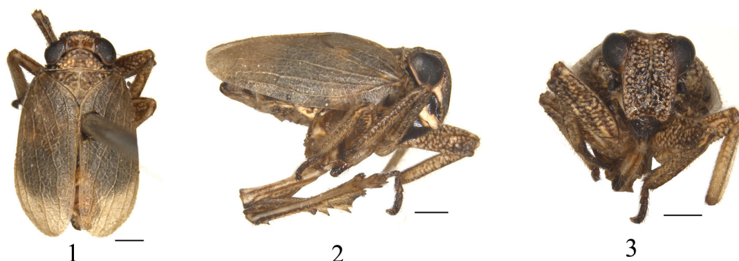
FIGURES 1–3. Folifemurum duplicatum sp. nov. 1. holotype, dorsal view; 2. holotype, lateral view; 3. holotype, frontal view. Scale bars = 0.5 mm.

middle; dorsolateral lobe of phallobase with a short tapering laminar process, with apex directed cephalad in dorsal view; ventral phallobase lobe with apical margin slightly concave medially, shorter than dorsolateral phallobase lobes. Pygofer with laterodorsal angles prominent; anterior margin slightly concave medially, longer than posterior margin, which is almost straight (Fig. 10).