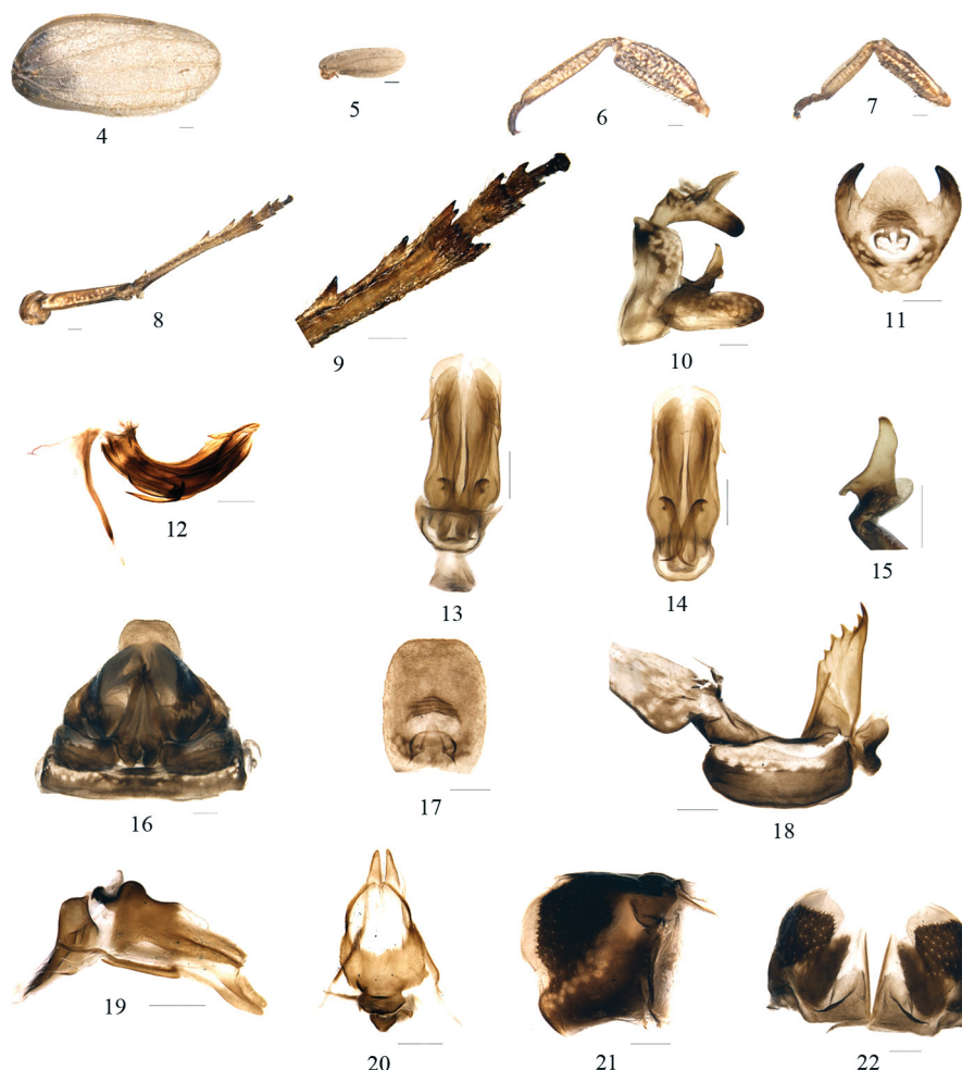
FIGURES 4–22. Folifemurum duplicatum sp. nov. 4. forewing; 5. hind wing; 6. fore leg; 7. middle leg; 8. hind leg; 9. apex of hind leg; 10. male genitalia, lateral view; 11. anal tube, dorsal view; 12. penis, lateral view; 13. penis, dorsal view; 14. penis, ventral view; 15. capitulum of style, dorsal view; 16. female genitalia, ventral view; 17. anal tube, dorsal view; 18. gonocoxa VIII and gonapophyse VIII, lateral view; 19. gonapophyses IX, lateral view; 20. gonapophyses IX, dorsal view; 21. gonoplac, lateral view; 22. gonoplac, dorsal view. Scale bars = 0.2 mm.