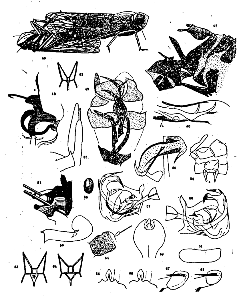
Details of Lesser Antillean Cixiini.