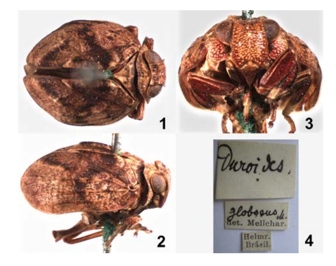
Figs 1–4. Duroides globosus Melichar, 1906, holotype. 1 – dorsal view; 2 – lateral view; 3 – frontal view; 4 – labels.

Supplementary description. Metope wide and long, nearly parallel-sided, weakly convex, densely covered with pustules, with very weak median carina running from its upper margin to its middle and with traces of sublateral carinae; upper margin concave (Figs 3, 11). Postclypeus slightly flattened frontally, without carinae. Metopoclypeal suture distinct, obtusely angulate. Pedicel sphaerical. Ocelli rudimentary. Coryphe transverse, nearly twice as wide as long; anterior margin almost straight; posterior margin concave, with median groove; lateral margins keel-shaped (Fig. 1). Coryphe and metope joint at obtuse angle (in lateral view) (Fig. 2). Rostrum short, nearly reaching hind coxae, with almost equal in length 2nd and 3rd segments, last one narrowing apically (Fig. 10). Pronotum slightly longer than corvphe at midline, without carinae; anterior margin convex; posterior margin weakly concave medially. Paradiscal fields of pronotum wide. Paranotal lobes wide, enlarged downwards, densely covered with pustules (Fig. 12). Mesonotum slightly longer than pronotum, with median groove and tiny lateral carinae. Tegulae large. Fore wings just covering ab-