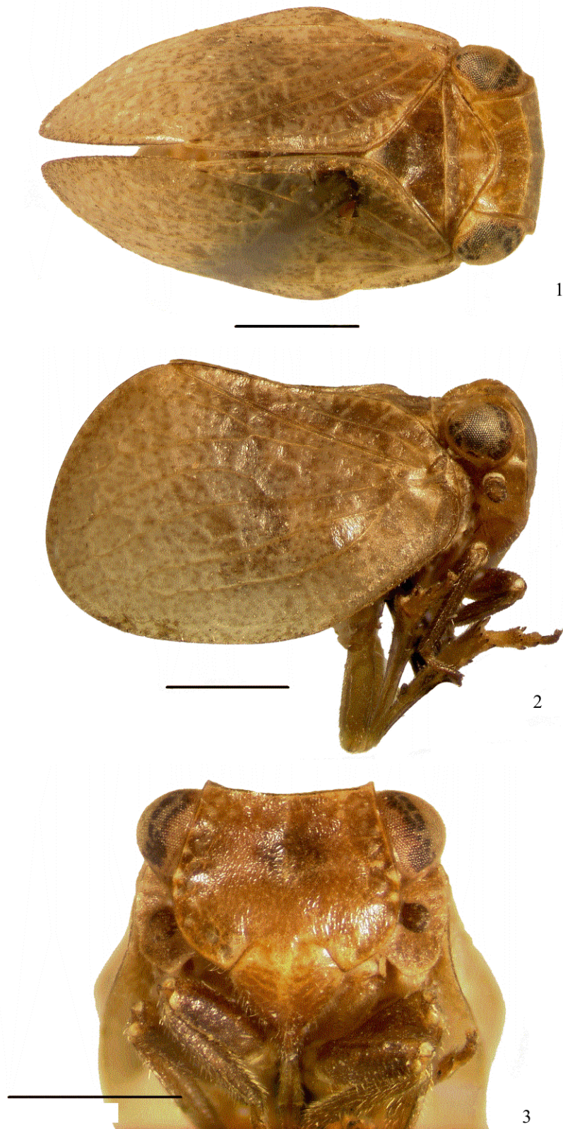
Figs. 1–3. Potaninum boreale (Melichar, 1902), female (paralectotype): (1) dorsal view, (2) lateral view, (3) front view. Scale bar 1 mm.