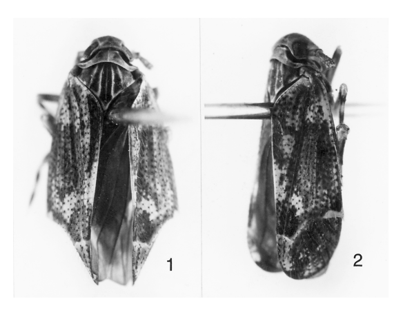
Figs. 1-2. Punana sinica Liang sp. nov. 1. male holotype, dorsal view; 2. same, lateral view.

late, veins distinctly prominent and thickly covered with fuscous granules with long setae, a more or less continuous series of transverse veins before apical area. For forewing and hindwing venation see Asche (1985: fig. 204).